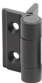
Hinges with closing spring