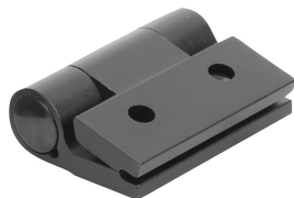
Hinges with opening spring