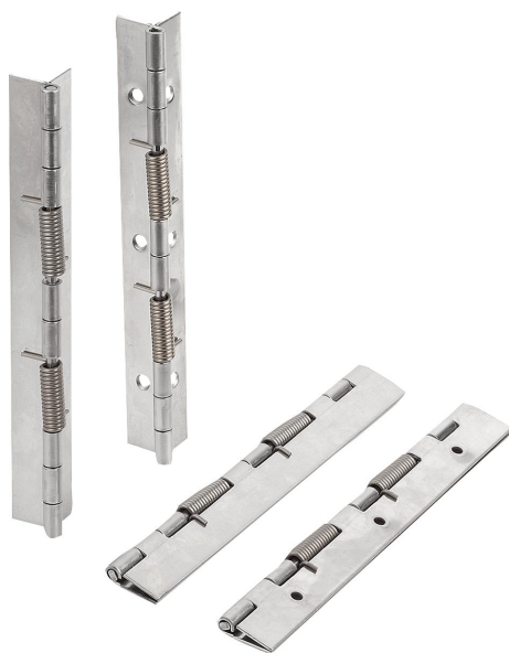
Hinges with closing spring